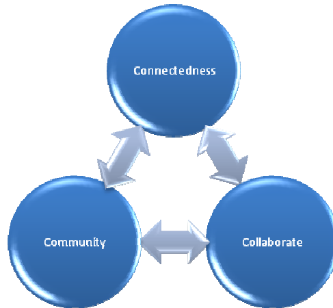
Figure 1: Characteristics of Social Media

Pictorially, the characteristics have been depicted below to show the inter-linkages between all characteristics and their mutual dependency.